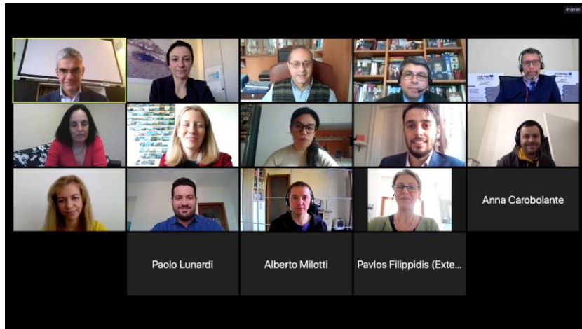
3° Cluster Meeting Online, 26th November 2020