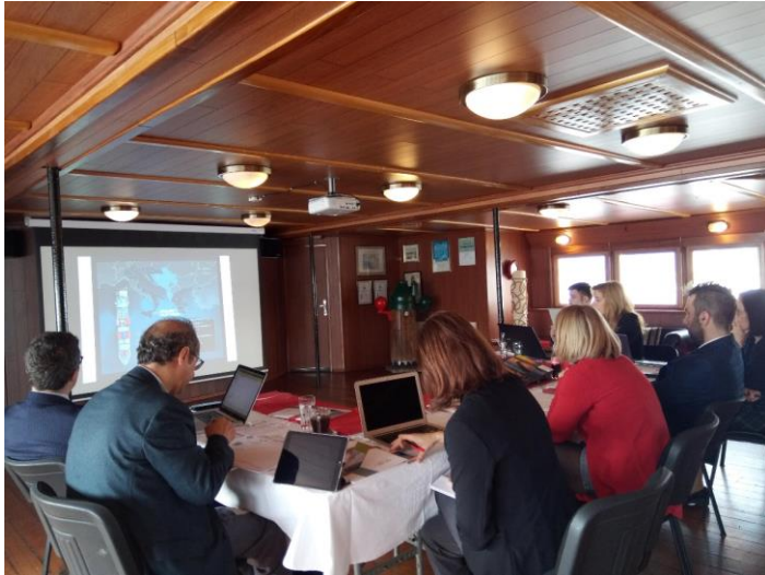
1° Cluster Meeting Rijeka, 12° February 2020